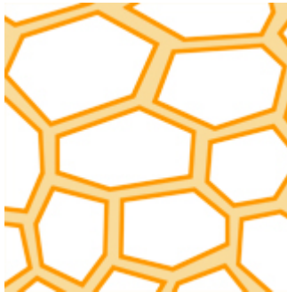
Open Cell Insulation

Open cell foam insulation is not completely closed and allows for air to fill the open spaces in the insulation.